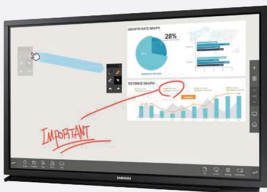
Figure 4. Feature for Easy Floating Menu and Draw on any Source