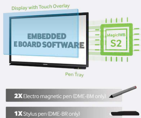
Figure 6. Packaged Offering of DME-BR/BM