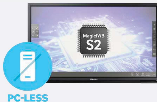
Figure 3. Embedded e-Board Solution that doesn't require a dedicated PC