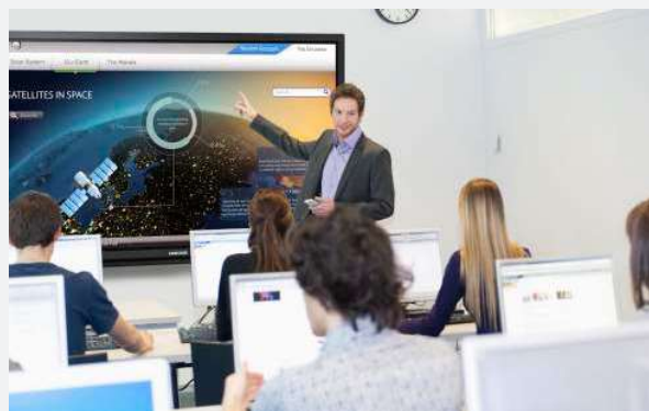
Figure 2. New lines of communication in the classroom

Gone are the days of educators needing to factor in the logistics of a typical projector system and the pitfalls and distractions that they come with. Samsung Interactive Whiteboard Solution converts these past shortcomings into strengths through effective utilization of FHD displays and interactive whiteboards. New lines of communication between teachers and students can now be forged, through data and file-sharing capabilities between the Interactive Whiteboard Solution and devices of students, thus further creating an interactive presentation environment that holds attention spans and creates opportunity to diversify learning approaches. Samsung Interactive Whiteboard Solution is well suited to help you convert your classroom into an intensive and engaging learning environment.