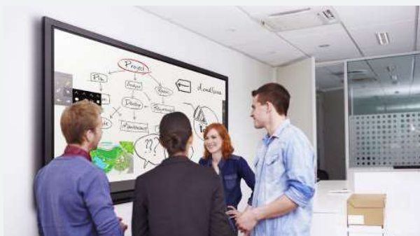
Figure 1. Increase productivity with interactive meetings